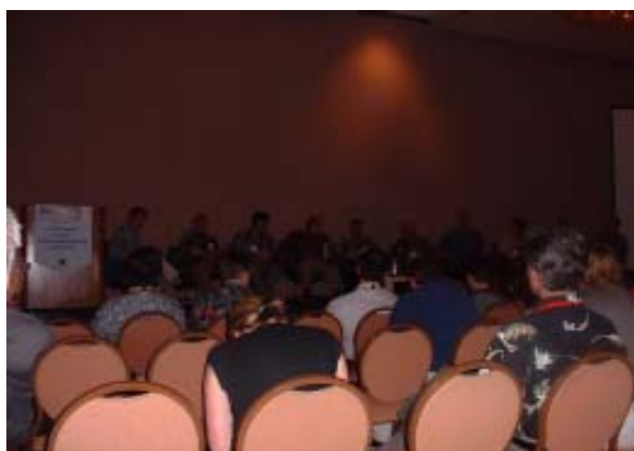
Satellite CEO Round Table

It is place to precede business talk between potential customer and supplier in the field of any communications by occasion of Golf Tournament, cruising and etc during PTC Conference and Exhibition.