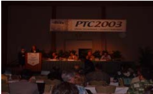
Panel Discussion Satellite CEO Round Table

question. Self Insurance is also discussed for the indemnification against launch and in orbit failure.