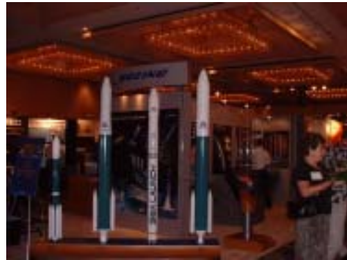
Exhibit- 2 (Boeing)