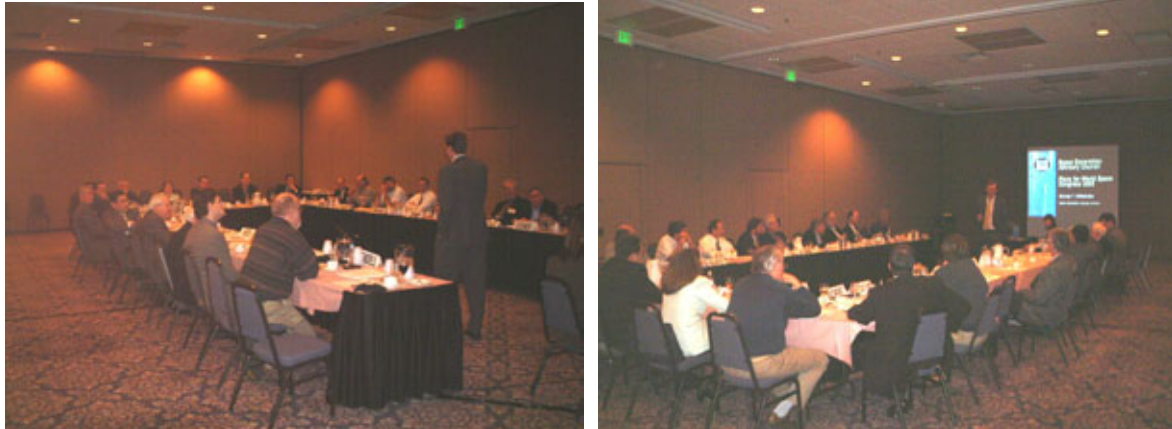
Snapshots of the AIAA-IAC meeting at Reno Hilton Hotel