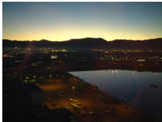
Reno Hilton Hotel as a meeting site and the scene from the hotel just before the sunrise at about 7 a.m.