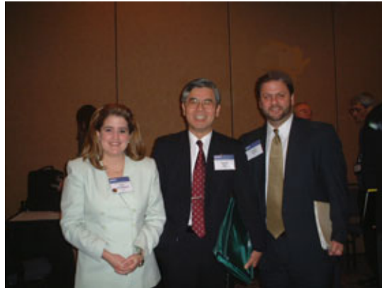
With AIAA staff: