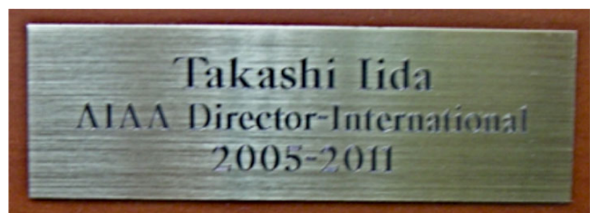
Commemorative plaque on the top of table clock