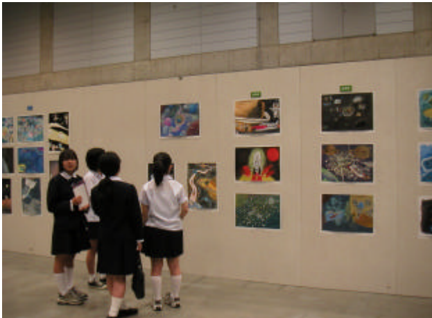
Excellent Prize for “Space” Paintings

The exhibition was held at Kunibiki Messe, a part from Shimane Prefectural Assembly Hall. Shuttle bus service was provided to participant every 20 minutes. More than 10,000 people, including primary to university students, were visited. Many student could experienced the actual space development through the exhibition. Also, there was the excellent prized display of the paintings of “Space Development”, selected from