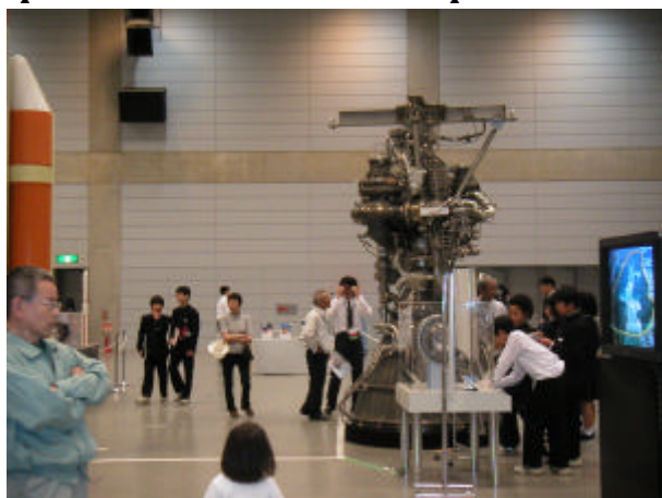
Exhibition Hall at Kunibiki Messe

heat of Matsue's social welfare activities. There were many flags of ISTS in the street and the conversation of "Big guy of Japanese Space Activities came to Matsue" was heard when I was in Soba Restaurant "Japanese Buckwheat Noodle shops". It was same case when I visited Bisei Spaceguard Center, where continuously observing the debris form deep space to the earth, at Bisei-town in Okayama Prefecture as a member of technical tour. People of Okayama gave us the same support as that of Shimame. They kindly opened their facility in spite of their regular holiday on that day.